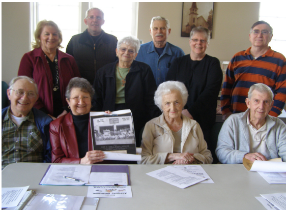
Photo above: Some of the many Tualatin Fire Dept. history folks who shared their stories and memorabilia.